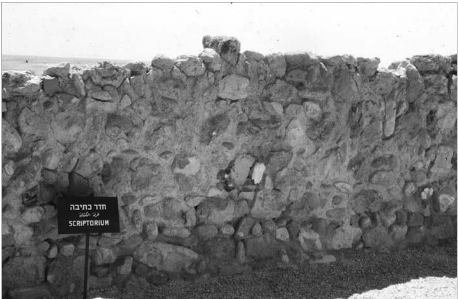
Pict. 2. Khirbet Qumran. The supposed scriptorium.