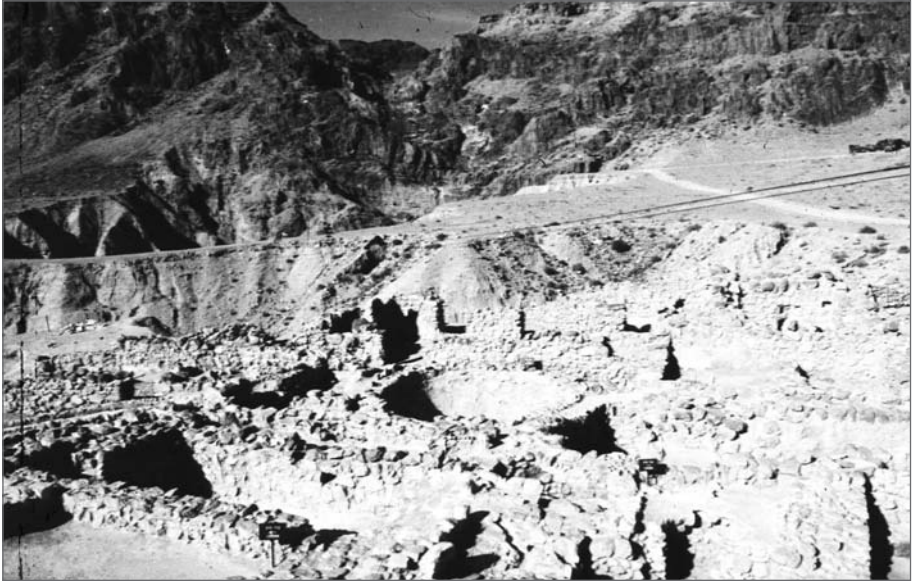
Pict. 1. Khirbet Qumran.